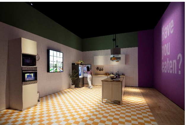
Model: Kitchen (2022) by Divaagar

One of the highlights of MENTAL is a newly commissioned multi-media installation by Singaporean artist Divaagar. Opening the exhibition, the installation highlights the importance of food in Singapore as a unifying cultural thread, where asking if someone has eaten is a way of showing care.