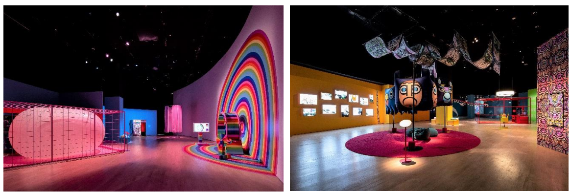
Various artworks situated within the galleries of MENTAL: Colours of Wellbeing

MENTAL: Colours of Wellbeing embraces the notion that every mental health journey is unique. The exhibition has been designed so that visitors can chart their own path through the varying installations, in the same way that each person's journey is unique and personal. There are no set routes to follow, and visitors can decide how, and in what order they would like to experience it.