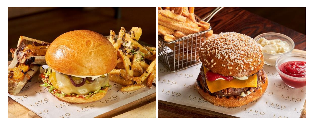
LAVO presents two Independence Day creations (from L to R): wagyu and marrow; sweet burger

During this special unagi festival , guests can enjoy the popular delicacy in four different ways during dinner daily, from appetisers such as the smoked uzaku (S$18++), a cold dish served with wakame, cucumber, watermelon radish and sweet vinaigrette, and una tamayaki (S$20++), a grilled eel rolled dashi Japanese omelette with daikon ankake, to the tantalising unadon (S$52++) for a satisfying main. Seek a cosy soirée out by the intimate bar & lounge amidst the restaurant's dramatic setting and relish a trio of una temaki (S$36++) while sipping signature cocktails such as the eye-catching KOMA Canary (S$25++), a refreshing concoction brimming with Tanqueray Flor de Sevilla Gin, lemon juice and a touch of saffron. For reservations, visit marinabaysands.com/restaurants/koma-singapore.html.