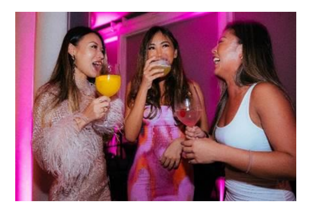
Come dressed in shades of the month and party the night away at 'Shades of Spago' over a one-night only menu by Spago and Artemis

with deep-fried churros and panna cotta and strawberry sauce. For reservations, visit marinabaysands.com/restaurants/lavo.html.