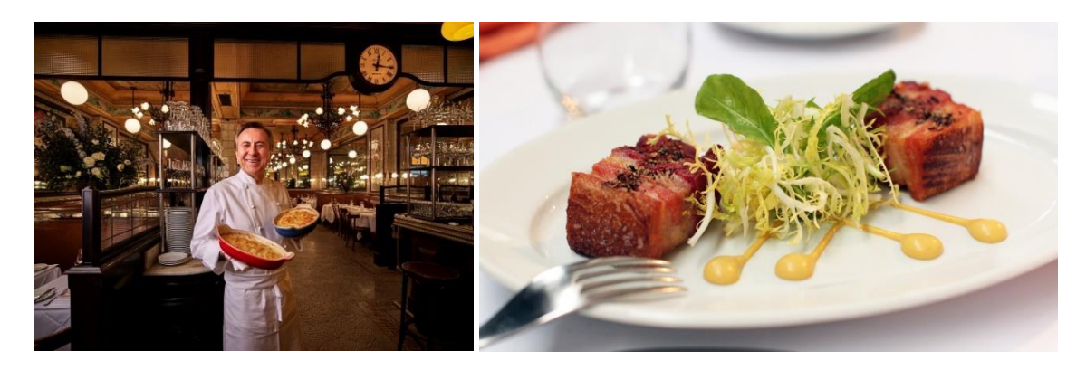
Commemorate France's National Day over a special dinner menu starring classic Parisian bistro favourites like the crispy pork belly rillon

In honour of Black Tap 's new location in Nashville and new menu items inspired by the community, Black Tap locations across the globe including Singapore are rolling out the Hot Chicken Sandwich (S$23++). Feel the heat with a spicy and crunchy combination of crispy chicken, black garlic and chilli seasoning and hot chilli oil. The burger is topped with parsley, pickle chips and buttermilk-dill, amping up the mix of Asian chillis and Italian spices over a boldly flavourful feast till 30 June. For reservations, visit <u>marinabaysands.com/restaurants/black-tap.html</u>.