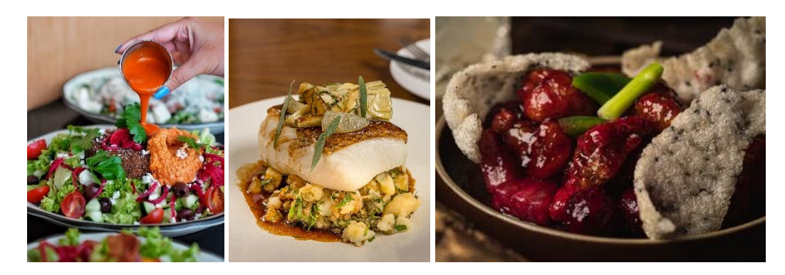
Wellness takes centrestage at Marina Bay Sands' restaurants from 17 June to 9 July (from left to right): Black Tap's house-made falafel burger salad; Bread Street Kitchen's roasted cod; Mott 32's plant-based sweet & sour "pork"

Singapore (9 June 2023) – This June and July, Marina Bay Sands is celebrating wellness with a series of nourishing menus across eight award-winning restaurants as part of the integrated resort's three-week festival '<u>Where Mind & Body Connect</u>' (17 June to 9 July).