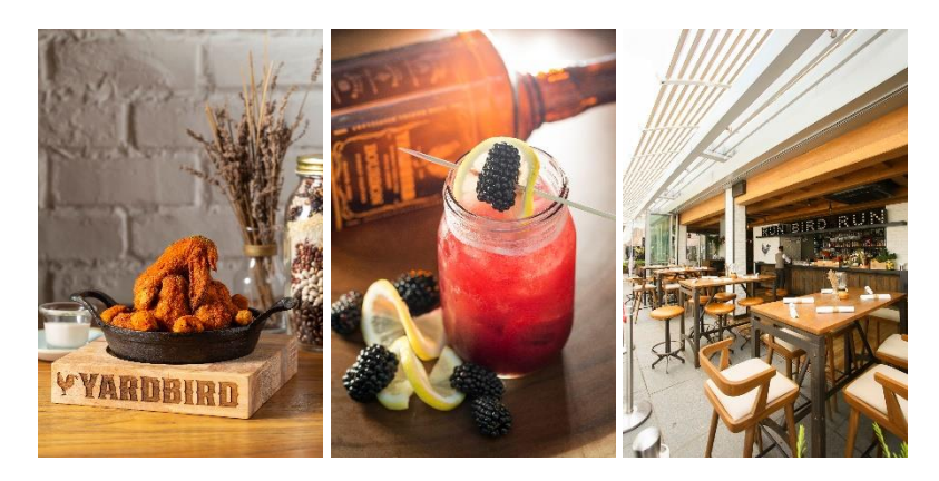
Enjoy complimentary Nashville wings with every purchase of a Yardbird signature cocktail at The Loft on Level 1

Waku Ghin's sushi omakase is available from Wednesday to Friday evenings from 6.30pm. A minimum of four diners or S$3,000 nett spend is required. For reservations, call +65 6688 8507 or email <u>WakuGhinReservation@MarinaBaySands.com</u>.