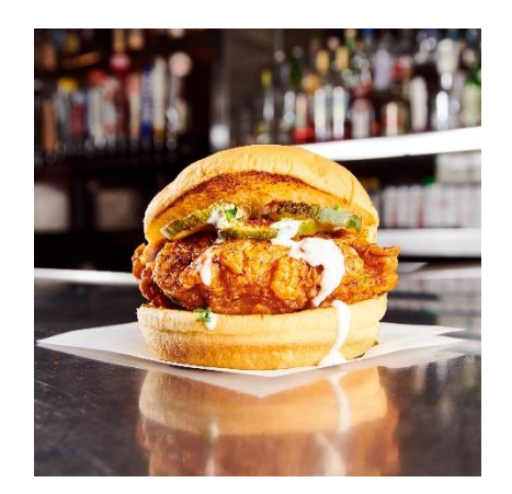
Black Tap's special Hot Chicken Sandwich this June

In honour of Black Tap 's new location in Nashville and new menu items inspired by the community, Black Tap locations across the globe including Singapore are rolling out the Hot Chicken Sandwich (S$23++). Feel the heat with a spicy and crunchy combination of crispy chicken, black garlic and chilli seasoning and hot chilli oil. The burger is topped with parsley, pickle chips and buttermilk-dill, amping up the mix of Asian chillis and Italian spices over a boldly flavourful feast till 30 June. For reservations, visit <u>marinabaysands.com/restaurants/black-tap.html</u>.