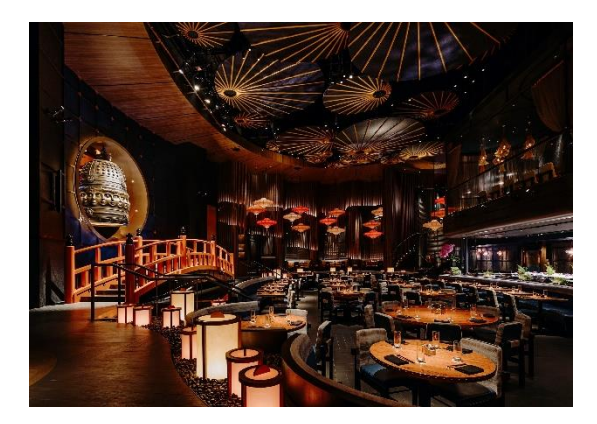
Be transported to Japan and indulge in KOMA's unagi festival creations

From 20 July to 7 August, KOMA Singapore is inviting all to commemorate the unique Japanese tradition of Doyō no Ushi (the Day of the Ox), a day during the peak of summer where it is a custom to eat eel for good health and prosperity. Rich in nutrients, the popular grilled freshwater eel nourishes the body with high content of vitamins and minerals to help locals combat Japan's hot summer days.