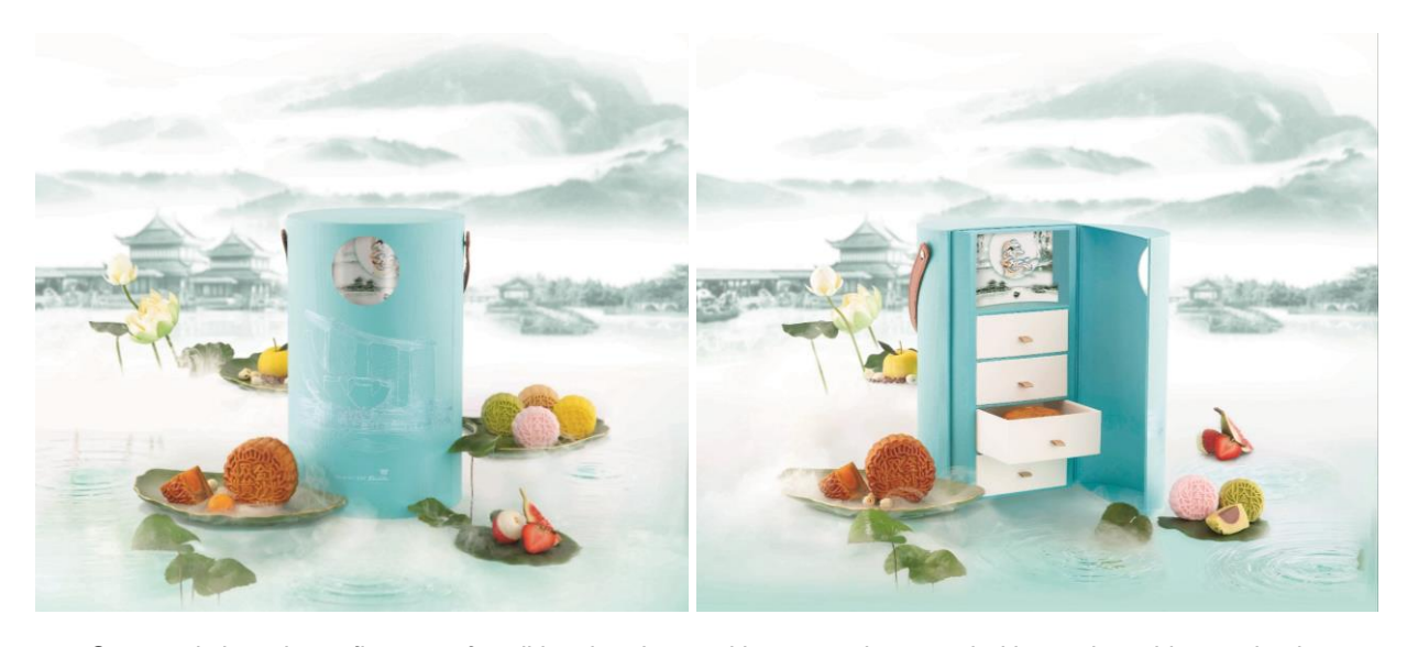
Savour six brand new flavours of traditional and snowskin mooncakes, nestled in a celeste blue packaging

Singapore (18 July 2019) – This Mid-Autumn Festival, Marina Bay Sands presents a brand new ensemble of traditional mooncakes and snowskin gems, featuring oriental flavours such as the brown sugar Chinese longan, as well as refreshing combinations of honey fig passion and strawberry lychee.