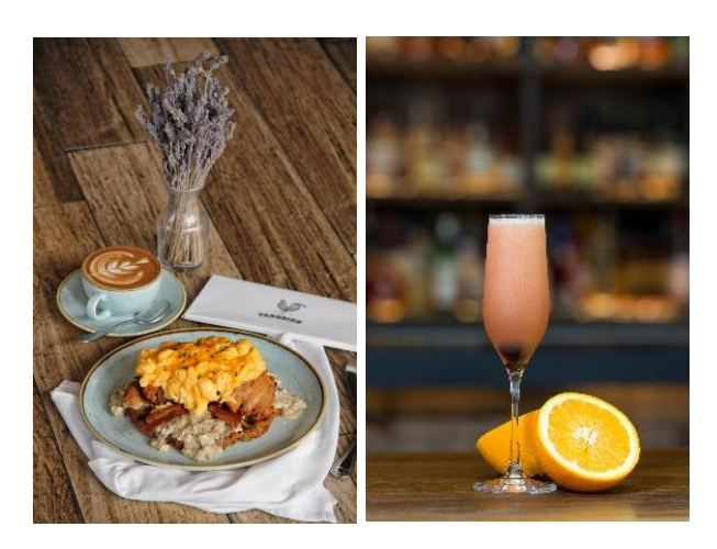
(From L-R): Delight in Yardbird's new brunch item bacon hash waffle & eggs ; guests can also enjoy free-flow glasses of the Southern Mimosa at $$30++

Classic American restaurant Yardbird Southern Table & Bar has recently refreshed its Great American brunch menu, available on weekends from 10am – 4pm. Kickstart the weekend with the new bacon hash waffle & eggs ($$24++), a dynamic combination of scrambled farm fresh eggs with chives and smoky bacon atop a fried hash waffle, complete with country gravy. For an elevated brunch, top up an additional $$10++ for a side of the restaurant's famed crispy chicken. Complete any entrée with the Sunny Morning Set ($$36++), which includes a choice of freshly squeezed juice such as green giant or orange ya glad , and coffee or tea. Those looking for a boozy brunch experience can also opt for 2-hour free-flow glasses of the citrusy Southern mimosa ($$30++).