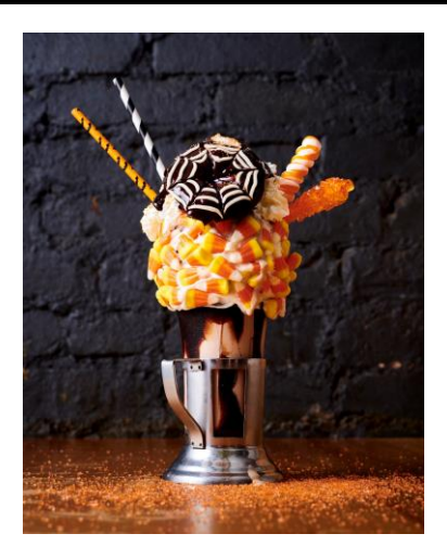
Begin the trick or treat session with a towering The Halloween Shake

From 30 October to 1 November, celebrate Halloween in style with The Halloween Shake ($$22++) at Black Tap Craft Burgers & Beer . Exclusively available for three days only, the whimsical chocolate-based CrazyShake<sup>®</sup> is a visual feast, featuring a vanilla frosted rim plastered with candy corn, a chocolate 'spider-web' cupcake, orange and white twisty pops, orange rock candy, and a generous dollop of whipped cream speckled with orange sprinkles and chocolate drizzle.