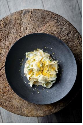
Rediscover ADRIFT's modern Asian dishes now available for takeaway (from L-R): savour the tender braised short rib with smoked bone marrow and vegetarian options like the celeriac noodles

Joining the roster of restaurants on Marina Bay Sands' gourmet takeaway platform is celebrity chef restaurant ADRIFT by David Myers . Savour dishes that are thoughtfully sourced and meticulously prepared, from signature bites such as the Alaskan king crab melt (S$14+) to the tender braised short rib (S$40+), complemented with smoked bone marrow, potatoes and leek. Vegetarian options are also available, such as the healthy and light celeriac noodles (S$21+), with ribbons of celeriac tossed in pine nut, cured yolk and parsley.