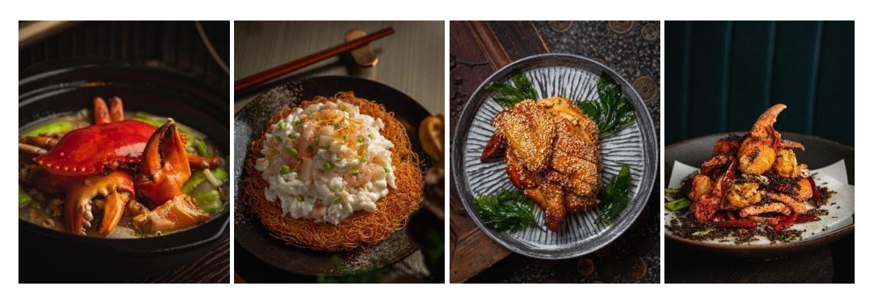
Mott 32's summer menu includes delicacies such as the (from L to R): braised crab casserole, fresh clam with winter melon, luffa; crispy egg noodle, stir-fried egg white with prawn, scallop, conpoy; salt-baked free-range yellow chicken, sesame; and wok-fried Boston lobster with crispy olive vegetables

By popular demand, contemporary Chinese restaurant Mott 32 will be extending its limited-time summer menu until the end of September. Prepared using authentic Chinese culinary techniques, the menu features highlights such as the luxurious braised crab casserole and fresh clam with winter melon and luffa ($$150++) – a fresh whole crab is braised with seasonal winter melon and fresh clams, accompanied with coix seeds and luffa which absorb the natural flavours of the rich broth. Not to be missed are also the crispy egg noodle with stir-fried egg white, prawns, scallops and conpoy ($$32++), as well as the wok-fried Boston lobster with crispy olive vegetables ($$90++).