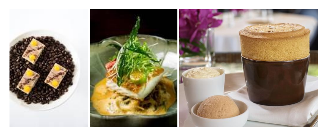
Spago's sunset menu features the restaurant's greatest hits (from L to R): kaya toast; Japanese sea bream "laksa"; and salted caramel soufflé

Experience sky-high dining at its best at Spago by Wolfgang Puck , as the restaurant presents a three-course sunset menu (S$78++) comprising its timeless classics and seasonal specials. Bask in the golden hour and start the evening with a seasonal handmade sweet corn agnolotti , featuring pockets of handmade pasta packed with sweet corn and mascarpone, coated in delicious sage butter sauce and topped with parmigiano reggiano, or the innovative kaya toast (top up S$10++) – a delicate treat of seared foie gras, pandan-coconut jam and foie gras-espresso mousse atop a crisp toasted brioche.