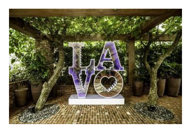
Enjoy a lavish, free-flow brunch at LAVO's iconic Sunday Champagne Brunch

LAVO Italian Restaurant & Rooftop Bar is bringing back its iconic Sunday Champagne Brunch, now renewed and served a la carte. For S$88++ per person, diners can enjoy a lavish, free flow