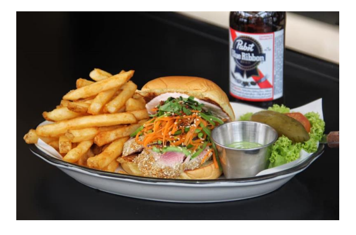
Black Tap introduces the Tuna Furikake burger as a limited-time special for the month of September only

From 30 October to 1 November, celebrate Halloween in style with The Halloween Shake ($$22++) at Black Tap Craft Burgers & Beer . Exclusively available for three days only, the whimsical chocolate-based CrazyShake<sup>®</sup> is a visual feast, featuring a vanilla frosted rim plastered with candy corn, a chocolate 'spider-web' cupcake, orange and white twisty pops, orange rock candy, and a generous dollop of whipped cream speckled with orange sprinkles and chocolate drizzle.