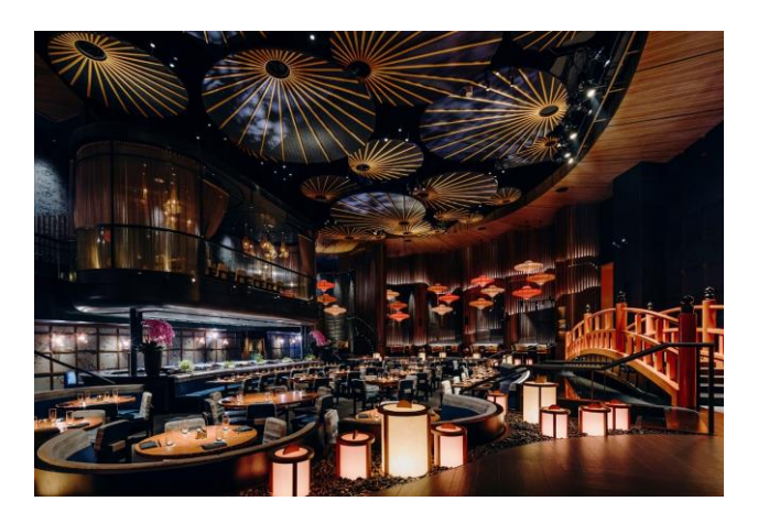
Enjoy KOMA's new cocktail menu at the modern restaurant with breath-taking design

This October, toast to a refreshed cocktail menu at KOMA Singapore as the restaurant introduces several handcrafted cocktails, including a new signature cocktail, KOMA Phoenix ($$23++), a refreshing mix of tequila blanco, chili umeshu, agave nectar and lime juice. Other new additions include the Sakura Spritz ($$23++) with Sakura vermouth, Brachetto d'Acqui and Prosecco di Valdobbiadene, and the spirit forward Shiso Negron i ($$23++), KOMA's take on a the classic negroni using distilled Umeshu and fresh shiso leaf. The new cocktail menu will be available from 1 October.