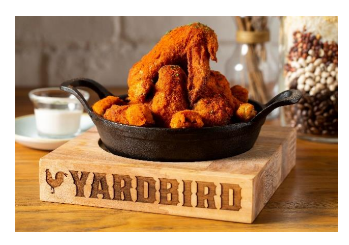
Experience the best of Yardbird's signature 100-year-old family fried chicken recipe over the Southern Fried Chicken Month menu

Classic American restaurant Yardbird Southern Table & Bar has recently refreshed its Great American brunch menu, available on weekends from 10am – 4pm. Kickstart the weekend with the new bacon hash waffle & eggs ($$24++), a dynamic combination of scrambled farm fresh eggs with chives and smoky bacon atop a fried hash waffle, complete with country gravy. For an elevated brunch, top up an additional $$10++ for a side of the restaurant's famed crispy chicken. Complete any entrée with the Sunny Morning Set ($$36++), which includes a choice of freshly squeezed juice such as green giant or orange ya glad , and coffee or tea. Those looking for a boozy brunch experience can also opt for 2-hour free-flow glasses of the citrusy Southern mimosa ($$30++).