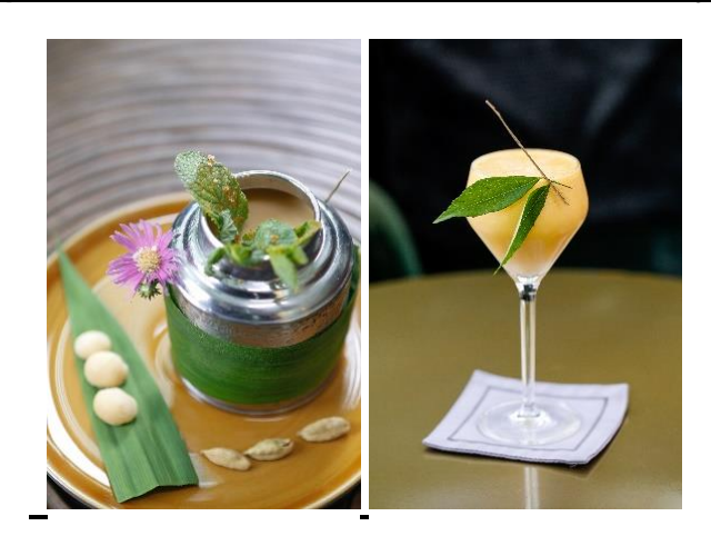
(From L-R): Relish in Renku's refreshing yogurt-based Rosella Lassi or Salted Egg , a local twist on the Dutch festive tipple Advocaat