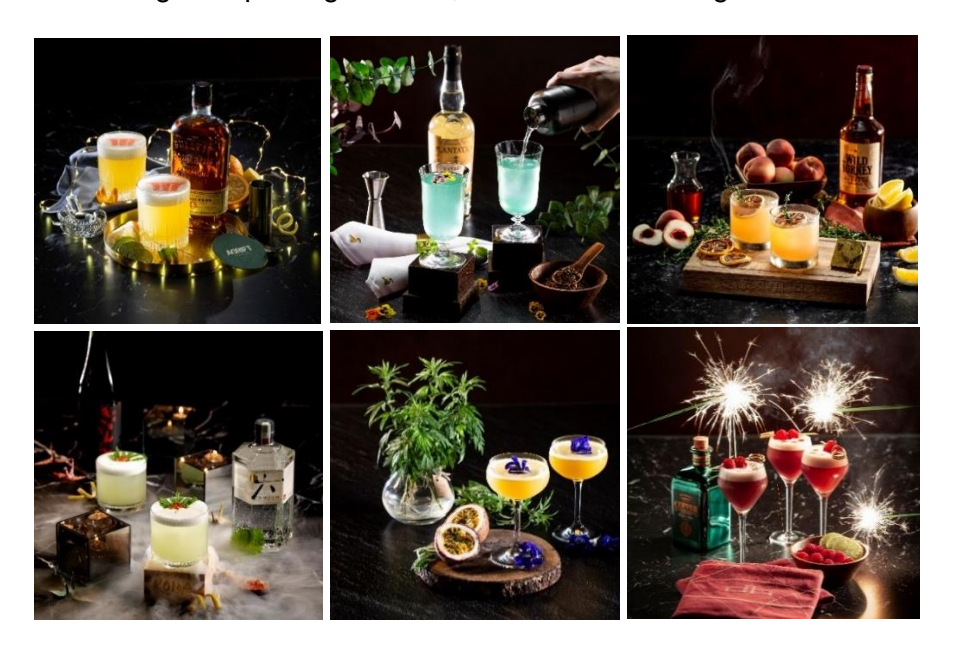
Marina Bay Sands' mixologists have created their most imaginative cocktails to date (clockwise from top left): ADRIFT's Re:Imagination ; Mott 32's East Atlantis ; Yardbird's Bourbon by the Bay ; db Bistro's Off the Runway ; Renku's Two-0-Two-0 ; and Koma's Dusk to Dawn

A spectacular showcase of over 10 unique cocktails across Marina Bay Sands' award-winning restaurants, 10 Years of Mixology invites guests to journey with the integrated resort down memory lane and through the passage of time, as it looks to reimagine the future.