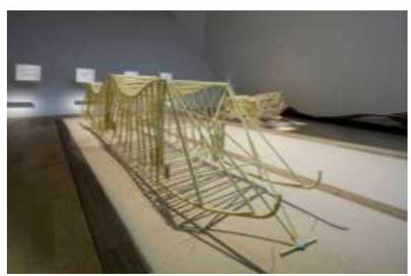
Animaris Burchus Primus at Wind Walkers

Also on show is the intriguing Animaris Burchus Primus , which bears an uncanny resemblance to a caterpillar. Unlike its predecessors, it is not wind-driven, but is instead pulled across the beach, or the gallery floor, by hand.