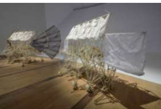
(L-R) Animaris Siamesis and Animaris Ordis at Wind Walkers

Also on show is the intriguing Animaris Burchus Primus , which bears an uncanny resemblance to a caterpillar. Unlike its predecessors, it is not wind-driven, but is instead pulled across the beach, or the gallery floor, by hand.