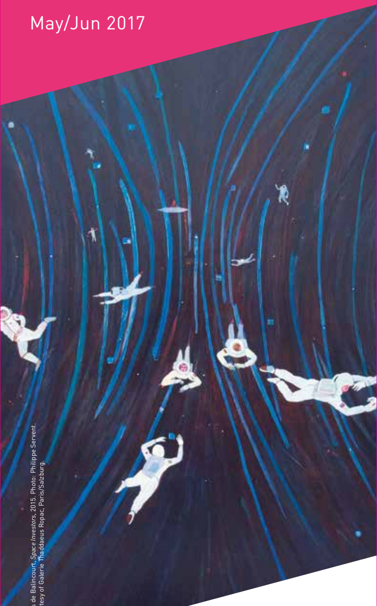
Jules de Balincourt, Space Investors , 2015.