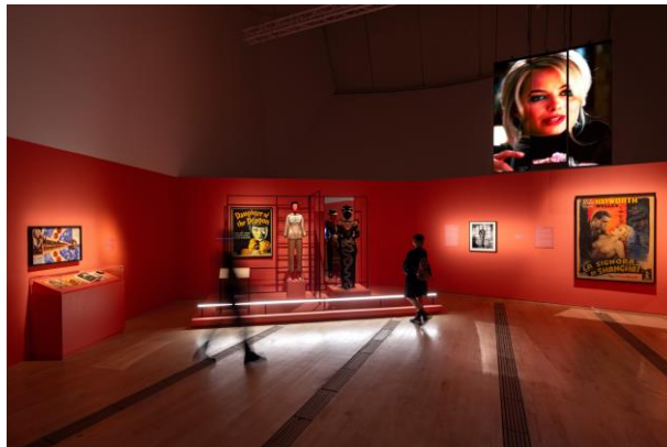
Dangerous Women section includes Tu Tuan's costume worn by Anna May Wong in Limehouse Blues (1934) and Cruella de Vil's costume worn by Glenn Close from 102 Dalmatians (2000)

One of the early screen legends who paved the way for other Asian stars to be cast as more diverse and complex characters is Wong Liu Tsong, known professionally as Anna May Wong – the first Chinese American Hollywood film star. Through archival material such as costumes, magazine clippings and movie posters from the 1930s, visitors can trace her journey in overcoming limited opportunities for Asian actresses in Hollywood.