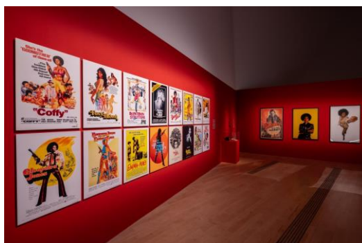
This section displays a collection of posters featuring Blaxploitation films

Fighting Back delves into the daring physical feats of actresses on screen – from classic stuntwomen to today’s action heroes – which challenge notions of female fragility. It also details how actresses of colour took on lead action roles, addressing both racial injustice and the women’s rights movements of the era.