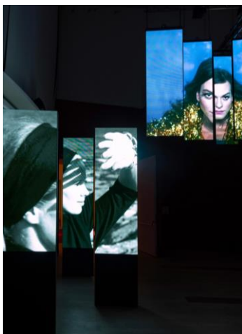
Hanging LED video columns feature various screen Goddesses

In a powerful moment of solidarity, visitors approach the end of their journey with a chance to walk out of the exhibition alongside various screen goddesses and icons from across the ages. A curated selection of clips features different characters across film and TV.