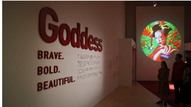
Entrance to Goddess: Brave. Bold. Beautiful. features a red carpet and spotlights

Setting the stage for an empowering journey through Goddess is a soundscape titled In Her Words by composer and music producer Chiara Costanza. Upon entering the exhibition, visitors will be greeted by the voices of various screen icons across the ages advocating for women to be heard for who they are, and not known just for their beauty and glamour. From French actress Léa Seydoux to Hollywood stars Nicole Kidman, Cate Blanchett and Viola Davis, these women had to defy expectations and the influence of the film industry to make their marks. Sampled from talk shows, movies, acceptance speeches and interviews, their voices of solidarity form a cultural legacy and remind visitors of the need to continue elevating the profiles and contributions of women in film – now and for generations to come.