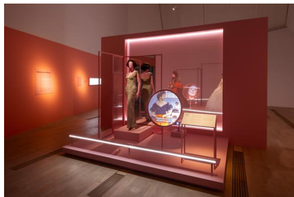
Dorothy Dandridge's section in Crafting the Ideal