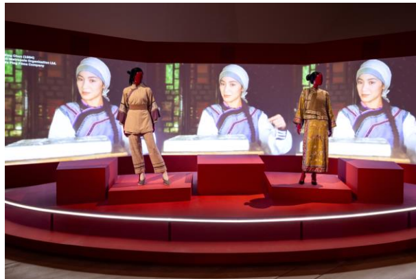
Costumes worn by Michelle Yeoh and Zhang Ziyi in Crouching Tiger Hidden Dragon (2000)

Chinese actress Zhang Ziyi and Hong Kong actress Maggie Cheung charmed audiences in Hero (2002), with Zhang's performance as Moon, a mysterious assassin, receiving critical acclaim for the nuance and emotional depth she imbued in her character. Meanwhile, Cheung took on the role as the skilled swordswoman Flying Snow, playing her with mystery and complexity. While powerful and cutthroat, their characters showcased how stoic warriors can still be passionate, vulnerable and uphold a strong moral code.