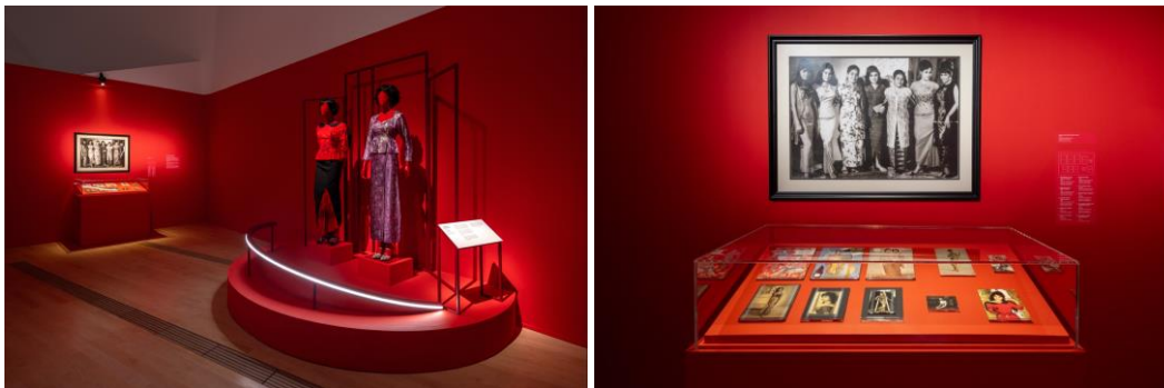
Visitors can explore the legacy of Malay cinema screen icons Saloma, Maria Menado and K. Fatimah in a newly-dedicated zone within the exhibition

A new addition to this iteration of Goddess , Cut from the Same Cloth profiles three film icons of the golden age of Malay cinema in Singapore which lasted from the 1940s to the 1970s – Saloma, Maria Menado and K. Fatimah.