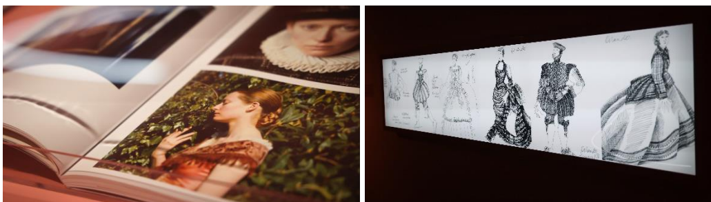
L to R: Behind-the-scenes content of Orlando (1992) include look books created for the film in Aperture magazine and costume sketches