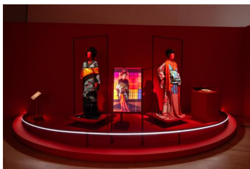
Kimonos worn by Japanese rockstar and model Anna Tsuchiya in the film Sakuran (2006)

American-born French singer and dancer Freda Josephine McDonald – also known as Josephine Baker – was known for her unique dance style and provocative costumes, with her fame providing a spotlight for her to speak out against racism and discrimination. Meanwhile, actress Mae West redefined on-screen femininity, with her larger-than-life and confident persona shining through her lavish costumes and platform shoes as she celebrated desire as an expression of independence.