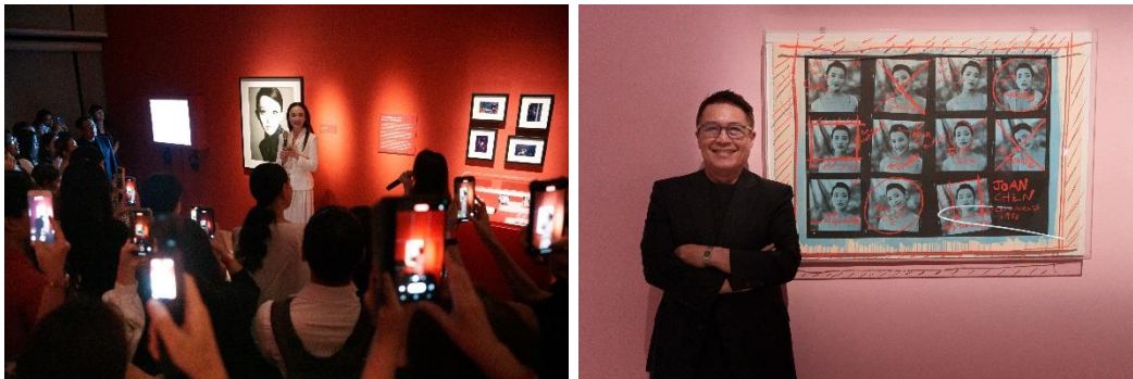
L to R: Homegrown actress Fann Wong made a special appearance at the exhibition; Russel Wong poses next to his blue litograph print of Chinese-American actress Joan Chen

Originally produced by ACMI, Australia's national museum of screen culture in Melbourne, this new iteration created in collaboration with ArtScience Museum places the spotlight on Asian film luminaries, such as Maggie Cheung, Anna May Wong and Gong Li, showing how they have redefined our contemporary vision of a screen goddess.