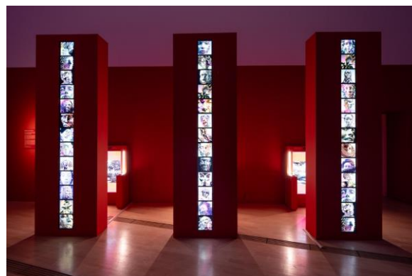
Goddess in the Machine

Having continually defied conventions and pushed boundaries, these Asian screen icons helped to blaze the trail for greater Asian representation in cinema. The mainstream success of wuxia films in the West also saw a cross-cultural pollination that resulted in greater diversity of cinematic styles and stories.