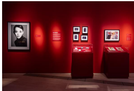
A section dedicated to Singapore's very own Goddess Fann Wong

Singapore also saw its own fierce and fabulous action heroine in the form of celebrated local actress Fann Wong, who has demonstrated her fighting abilities in an impressive range of local movies and TV series such as The Legend of Lu Xiaofeng (2006) and The Return of the Condor Heroes (1998).