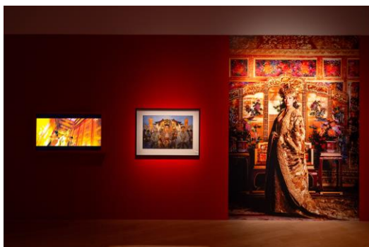
Section titled Gold on the Outside captures Gong Li's striking moments in Curse of the Golden Flower (2006)

Visitors will be able to admire the costumes that were vital to the film's visual style and emotional journey of the characters, with highly detailed, ornate, and colourful kimonos that incorporated hallucinatory colours and patterns using traditional Japanese dyeing techniques to combine period-accurate authenticity with punk rock sensibility. Both kimonos were worn by Tsuchiya in her role – the energetic mix of red, baby pink, blue, purple and motif of flying cranes on one represents the youthful rebellion when Kiyoha was younger, while the other reflects her growing wisdom and status as head courtesan with its deep, moody blue colour and flowing gold and orange obi sashes.