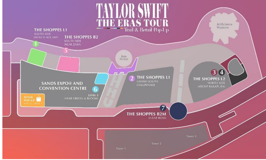
Taylor Swift | The Eras Tour Trail will take place across Marina Bay Sands

From 28 February, selected parts of The Shoppes and Sands Expo & Convention Centre<sup>1</sup> will morph into a haven for fans of the popstar through Taylor Swift | The Eras Tour Trail. Embarking on a visual narrative of the award-winning artist's journey, members of the public will be able to live out Taylor Swift's 10 iconic eras through seven installations. Each zone will offer a unique glimpse into Taylor Swift's musical evolution, paying homage to pivotal seasons like the "Lover" era and transporting fans back in time to the nostalgic "1989" era. For more details on opening hours and access to these installations, please refer to the FAQ in the appendix below.