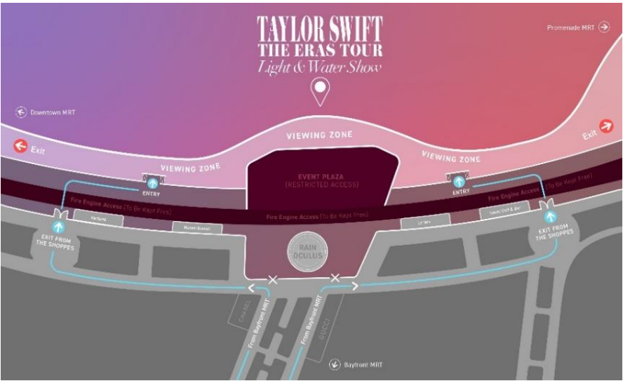
Members of the public can catch the Taylor Swift | The Eras Tour Light & Water Show at various vantage points