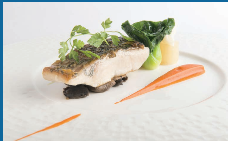
Pan-Seared Seabass from the Harvest Menu

Would you like to educate your attendees or VIP guests about the green initiatives of the event venue you chose? We provide Sands ECO360 tours to showcase the sustainability efforts at our resort!