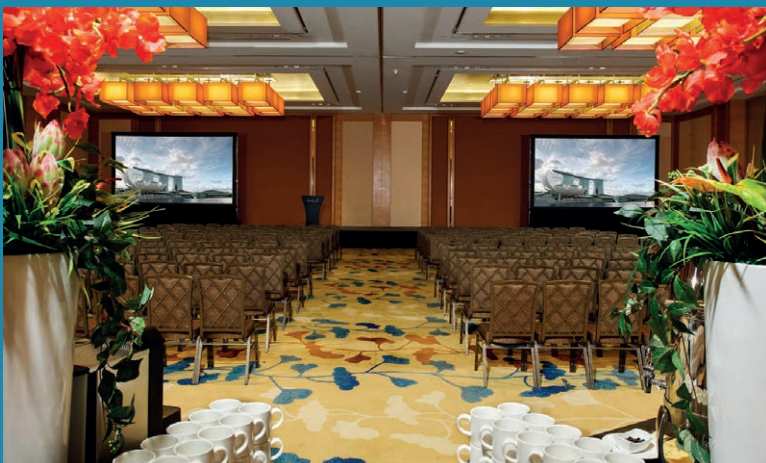
Green Meetings Set-up

We will consolidate your event's environmental impact data and highlights of your achievements for the ease of your communication to your stakeholders.