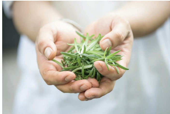
RISE Herb Garden

In addition to our standard green meeting practices, we provide sustainable options to our meeting planners and clients; offering many ways to further reduce the environmental impact of your event. Talk to your Green Meeting concierge to customize your green meeting options.