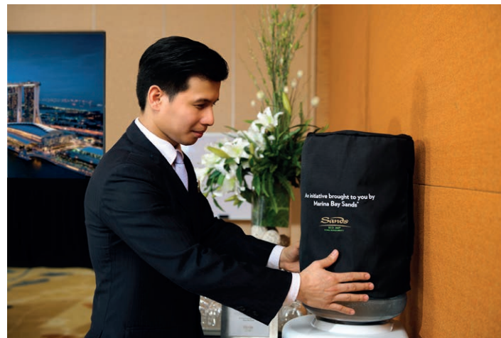
Green Meetings Concierge

They will be your dedicated guide and assist you throughout the entire event planning process!