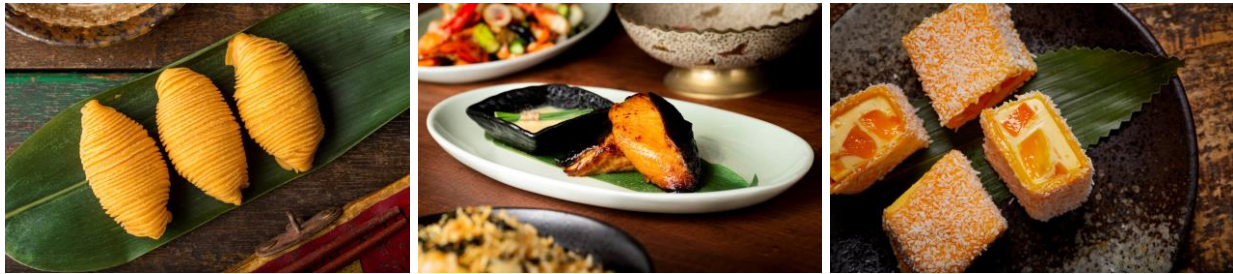
Mark your calendar for a weekend lunch at Mott 32 (from L to R): Australian wagyu beef puff; sticky black cod, mustard yuzu sauce; fresh mango, coconut, glutinous rice roll

Spruce up the weekends with a remarkable lunch at Mott 32, as the restaurant introduces two three-course weekend set lunch menus starring its famed classics. The first set (S$78++ per pax; minimum two pax) comprises a choice of starter between the crispy roasted pork belly or marinated jellyfish and cucumber , followed by a choice of dim sum or mains, which include the flaky Australian wagyu beef puff or roasted Australian lamb rack with Hunan chilli and black beans , before a tangy dessert of fresh mango, coconut, glutinous rice roll .