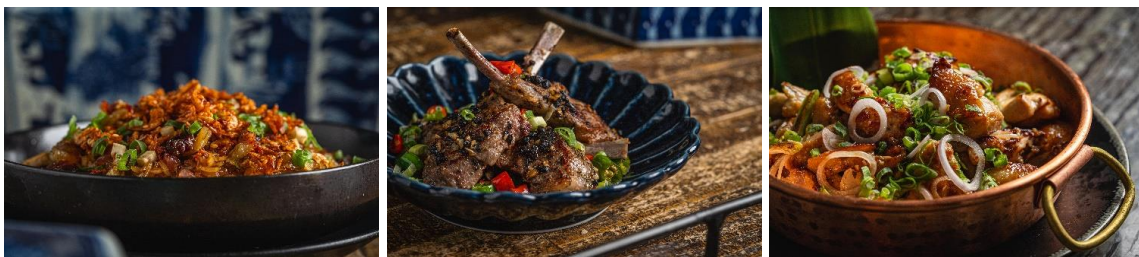
Fans of Mott 32 can taste a larger repertoire of dishes on its a la carte menu (from L to R): wok-fried glutinous rice; lamb rack with Hunan chilli and black beans; Shunde style pan-fried free-range chicken in sand ginger

Diners can also relish in over 20 new dishes on Mott 32's refreshed a la carte menu, available daily for both lunch and dinner. Indulge in brand-new creations such as the luxurious Pacific lobster (S$20++ per 100g) served three ways: with superior stock and ee fu noodles, steamed with minced garlic, or steamed with Chinese wine and egg white, and end the meal with Mott 32's new dessert, the nourishing double boiled imperial bird's nest & fresh milk in coconut (S$86++).