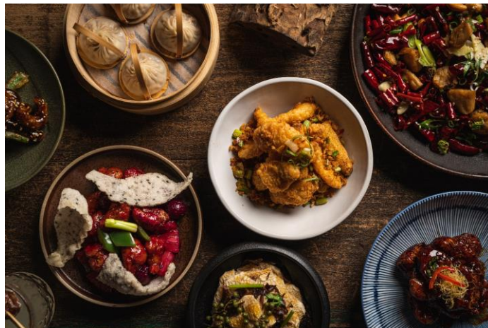
Enjoy plant-based alternatives of Mott 32's signature dishes

Mott 32 Singapore pushes culinary boundaries with new plant-based menu