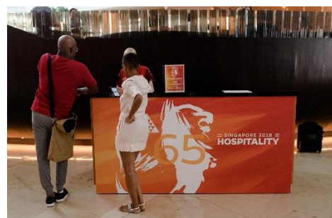
Renku was transformed into YPO-exclusive hospitality lounge.

For the first time, Marina Bay Sands reserved its recently revamped 24-hour hotel lounge, Renku, for exclusive access to YPO delegates throughout the event duration. This gave delegates an additional private venue to meet, network and carry out business transactions whenever they wanted to.