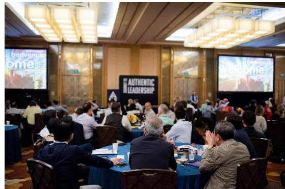
L-R: Delegates registering for YPO’s events; YPO EDGE and GLC featured a series of plenary sessions, concurrent sessions, discussions and networking over five days.

Altogether, the YPO group occupied a total of 7,736 room nights — the highest ever that the group has booked within a single venue. YPO also utilized nearly 360,000 sq. ft. of event space, equivalent to the entire Level 4 and 5 of the 1.3 million sq. ft. Sands Expo and Convention Centre.