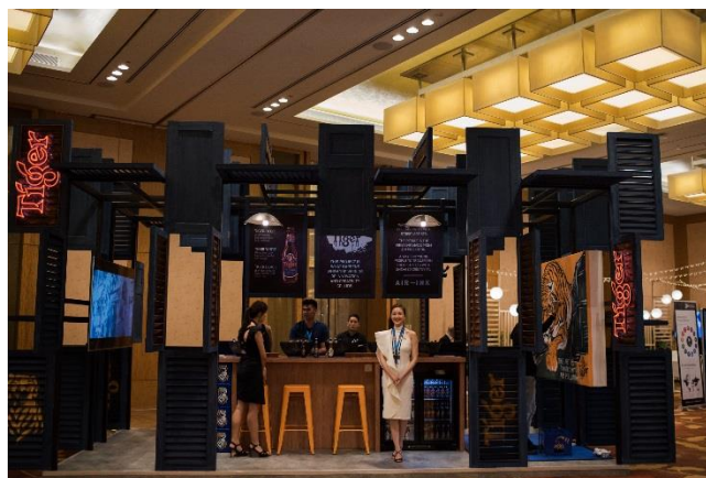
The Tiger Beer booth was one of the many exhibitors at the event's Venture Marketplace.

With YPO delegates hailing from more than 90 countries, there was a need for Marina Bay Sands' MICE team to cater to guests with special dietary requests — ranging from gluten-free and halal to vegetarian and vegan. The integrated resort's banquet team also curated special menus with over 20 varieties of food per meal, with additional complimentary dishes from the chef, to treat delegates to a selection of local and international food items.