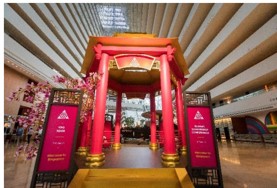
YPO's branding prominently displayed across the integrated resort including the Sands Expo and Convention Centre (top left) and the hotel entrance and lobby (top right and bottom).

During the event week, Marina Bay Sands was transformed into the home of YPO, with the organization's branding displayed across nearly all digital signage and advertising panels around the hotel lobby, The Shoppes at Marina Bay Sands and Sands Expo and Convention Centre. The integrated resort had a pagoda in the centre of its Tower 1 lobby — which YPO was able to brand, and it served as a photo-worthy backdrop for the organisation's delegates from all over the world.