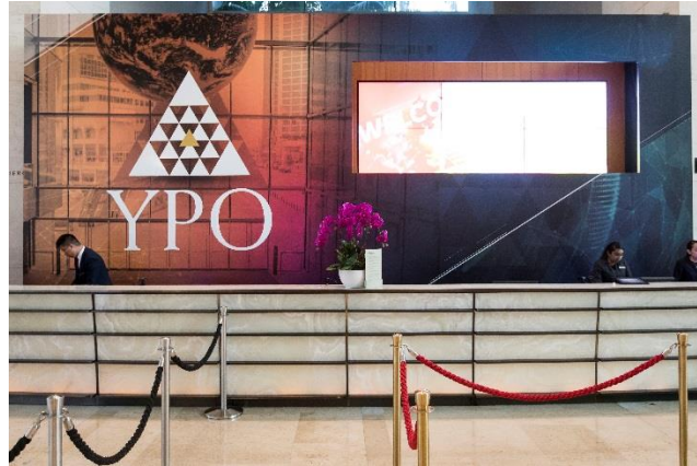
Dedicated check-in counter for YPO delegates to ensure a smooth arrival process.

Other personal touches included the set-up of a dedicated check-in counter for YPO attendees to ensure a smooth arrival process, the presentation of YPO-branded Marina Bay Sands chocolates as a welcome amenity, as well as a daily room turndown service with different Marina Bay Sands-branded tokens provided to delegates throughout their stay.