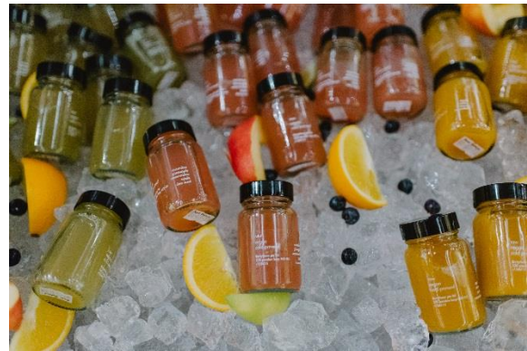
L-R: Marina Bay Sands' chefs set up live stations within the Venture Marketplace; cold pressed juices were also available to delegates at the event.