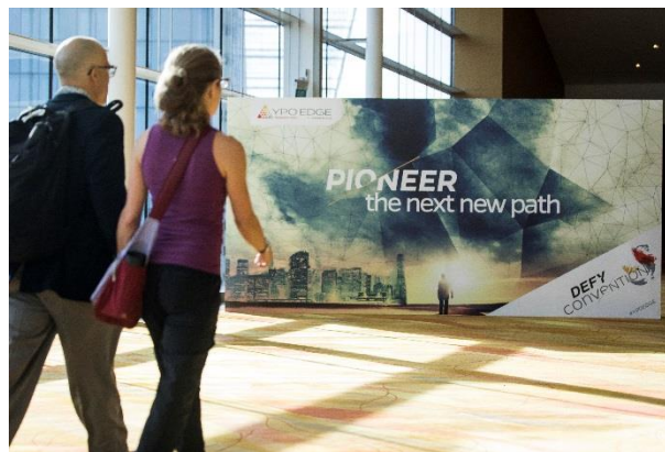
YPO's events occupied the entire Level 4 and 5 of the 1.3 million sq. ft. Sands Expo and Convention Centre.

At the end of the event, the organizers collected and recycled approximately 700 bags and achieved an overall event waste diversion rate of 75 percent, through recycling and food waste diversion efforts.