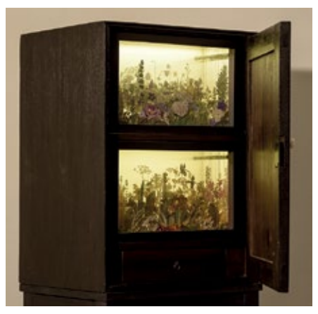
And We Were Like Those Who Dreamed, N/A

The Decline of the Western Civilisation playfully explores popular music. It features a figurine of Hong Kong's Heavenly King, singer Leon Lai, being squashed by the weight of the metal text 'Anthrax', the name of a well-known heavy metal band. The work symbolises the clash of two ideologies – Western and Chinese popular culture.