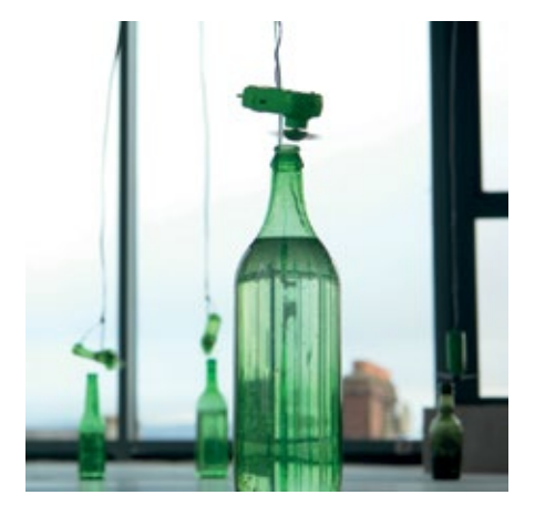
Bottles and Fans. 2010

Much of Lee Wen's work has been motivated by a desire to use art to interrogate stereotypical perceptions. Ping Pong Go-Round reinvents the structure and rules of Ping Pong to show alternative models of interaction between the players. Unlike the traditional table, Lee Wen's Ping Pong table has no borders, allowing multiple possibilities for a broader dialogue between players involved.