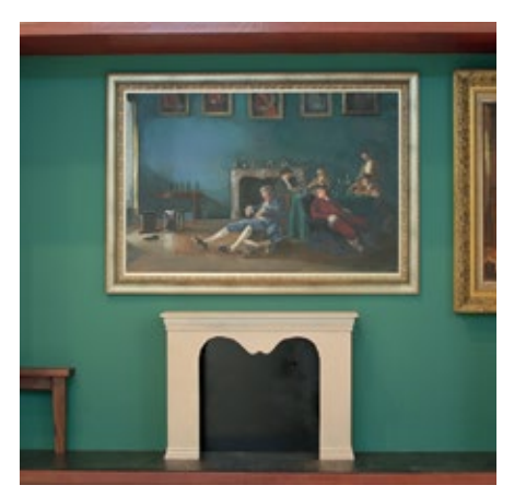
Drunk in the Morning, 2013