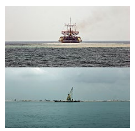
SEA STATE 2: Goryo 6 Ho, 2012