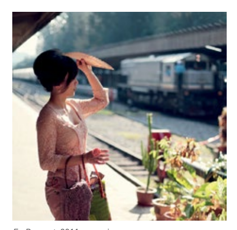
En Passant, 2011 - ongoing