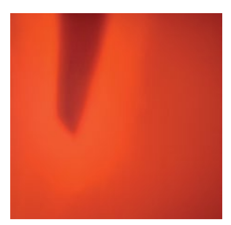
Red Trail Series - Power, 2007