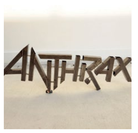
The Decline of the Western Civilisation, 2010