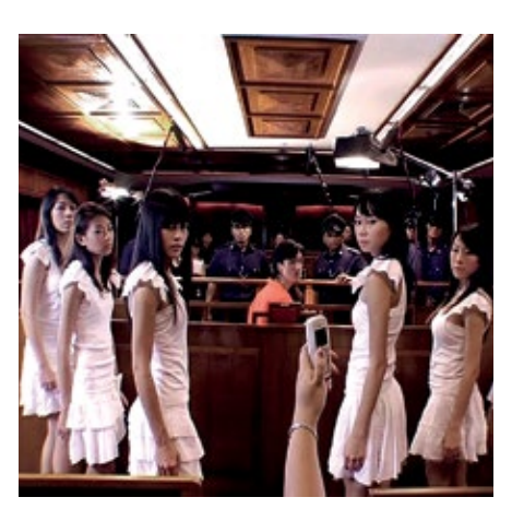
The Bohemian Rhapsody Project, 2006

In her work Beyond the Blue , a sculpted mass of extruded paint cascades down the wall and collapses onto itself. For Turned Out , she painted long, narrow strips of canvas with acrylic paint then rolled them into a circle, which is mounted on the wall. The resulting object — which resembles a hose or a reel of cord — is more sculpture, or wall relief, than painting. Works like these explore the way paintings have traditionally been perceived.