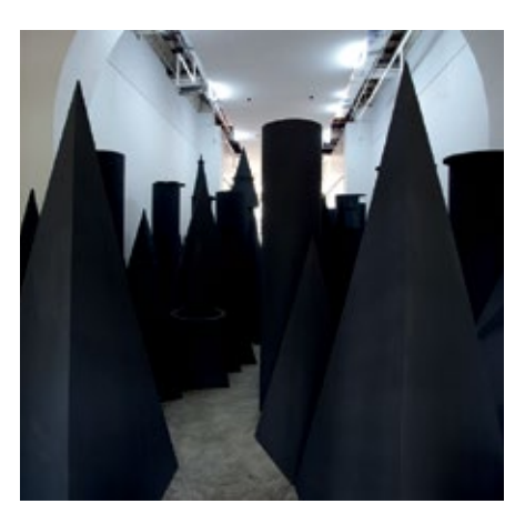
Master Plan, 2012

The SEA STATE series is drawn from Lim's ongoing exploration of Singapore's maritime geography and history. Lim offers a compelling exposure of humanity's impact on its physical environment, highlighting the interplay between natural and man-made, land and sea.