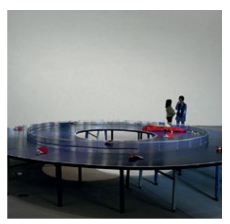
Ping Pong Go-Round, 2013

The Seven Scenes of Barry Lyndon features paintings based on scenes from the period film Barry Lyndon (1975) by Stanley Kubrick. It explores the concept of framing beyond the borders of each image.