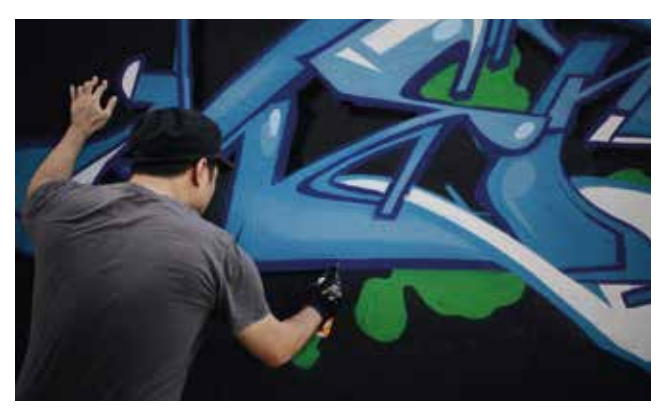
Saturday - 17 Mar | 10am - 10pm Various locations within ArtScience Museum

Explore your creative side in a series of engaging street art-related activities, masterclasses and workshops. Also, watch graffiti artists ASMOE (PB/ZNC), ALOTONE (DTB/TFK), SONG (RSCLS), MIZNEK (DTB/TFK) and REAPS (BMK) battle it out at the museum's first live Graffiti battle as they create their masterpieces from scratch. Join in the fun and vote for your favourite masterpiece!